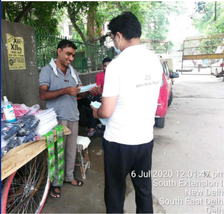
6 Jul 2020 12:01:47 pm South Extension II New Delhi South East Delhi Delhi