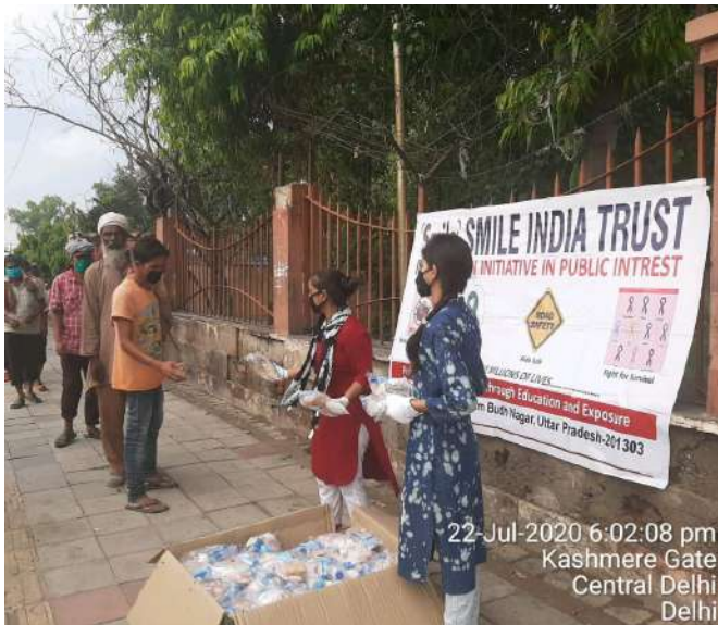
22-Jul-2020 6:02:08 pm Kashmere Gate Central Delhi Delhi