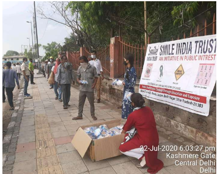
22-Jul-2020 6:03:27 pm Kashmere Gate Central Delhi Delhi