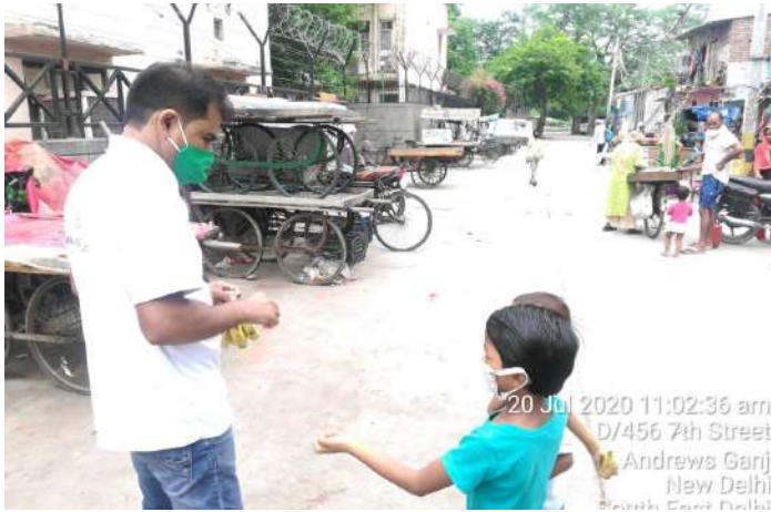
20 Jul 2020 11:02:36 am D/456 7th Street Andrews Ganj New Delhi South East Delhi