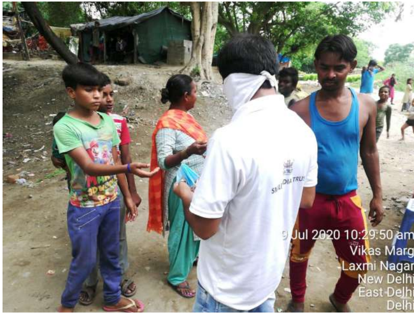
9 Jul 2020 10:29:50 am Vikas Marg Laxmi Nagar New Delhi East Delhi Delhi

Our volunteers spread awareness about precaution and prevention against Covid-19 through awareness and counseling.