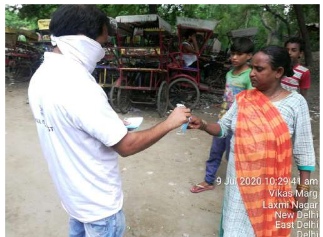
9 Jul 2020 10:29:41 am Vikas Marg Laxmi Nagar New Delhi East Delhi Delhi