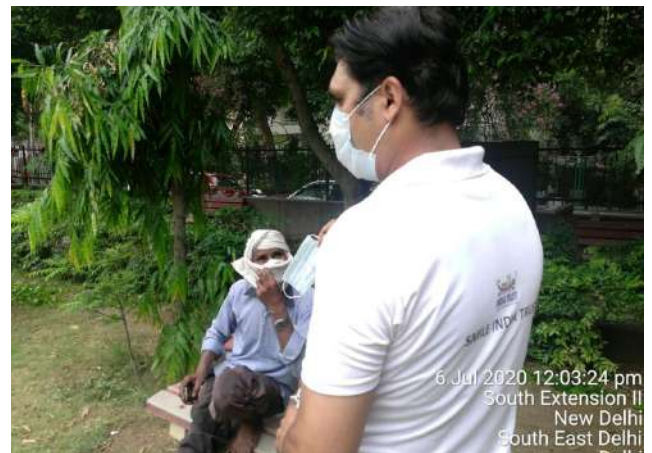
6 Jul 2020 12:03:24 pm South Extension II New Delhi South East Delhi Delhi