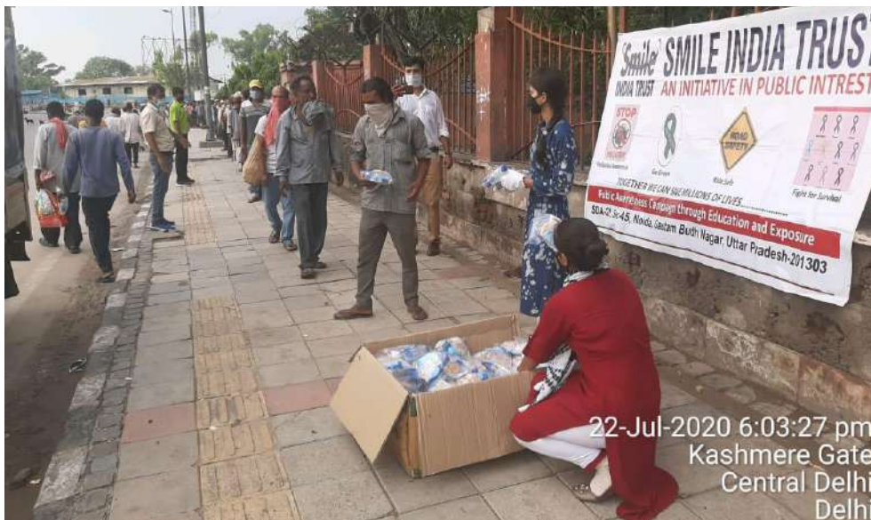
22-Jul-2020 6:03:27 pm Kashmere Gate Central Delhi Delhi