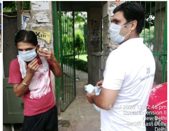
6 Jul 2020 12:02:46 pm South Extension II New Delhi South East Delhi Delhi