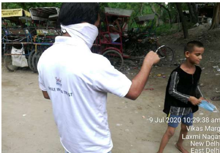
9 Jul 2020 10:29:38 am Vikas Marg Laxmi Nagar New Delhi East Delhi