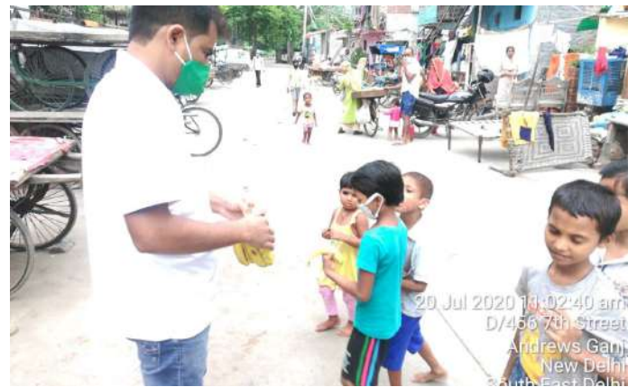
20 Jul 2020 11:02:40 am D/456 7th Street Andrews Ganj New Delhi South East Delhi

Charity sees the need, not the cause.. Feeding the future of our country.