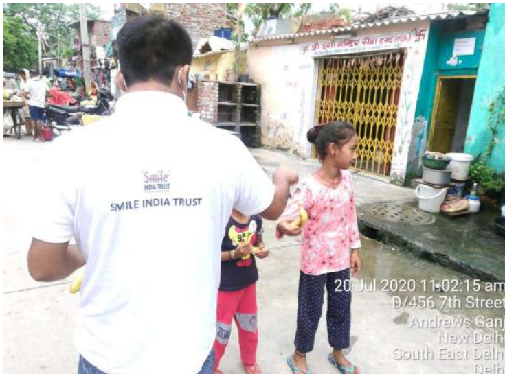
20 Jul 2020 11:02:15 am D/456 7th Street Andrews Ganj New Delhi South East Delhi Delhi