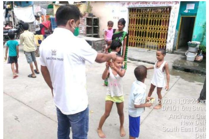
20 Jul 2020 11:03:24 am D/101 6th Street Andrews Ganj New Delhi South East Delhi Delhi