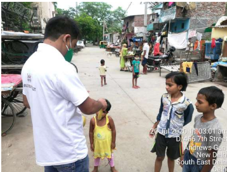
20 Jul 2020 11:03:01 am D/456 7th Street Andrews Ganj New Delhi South East Delhi Delhi