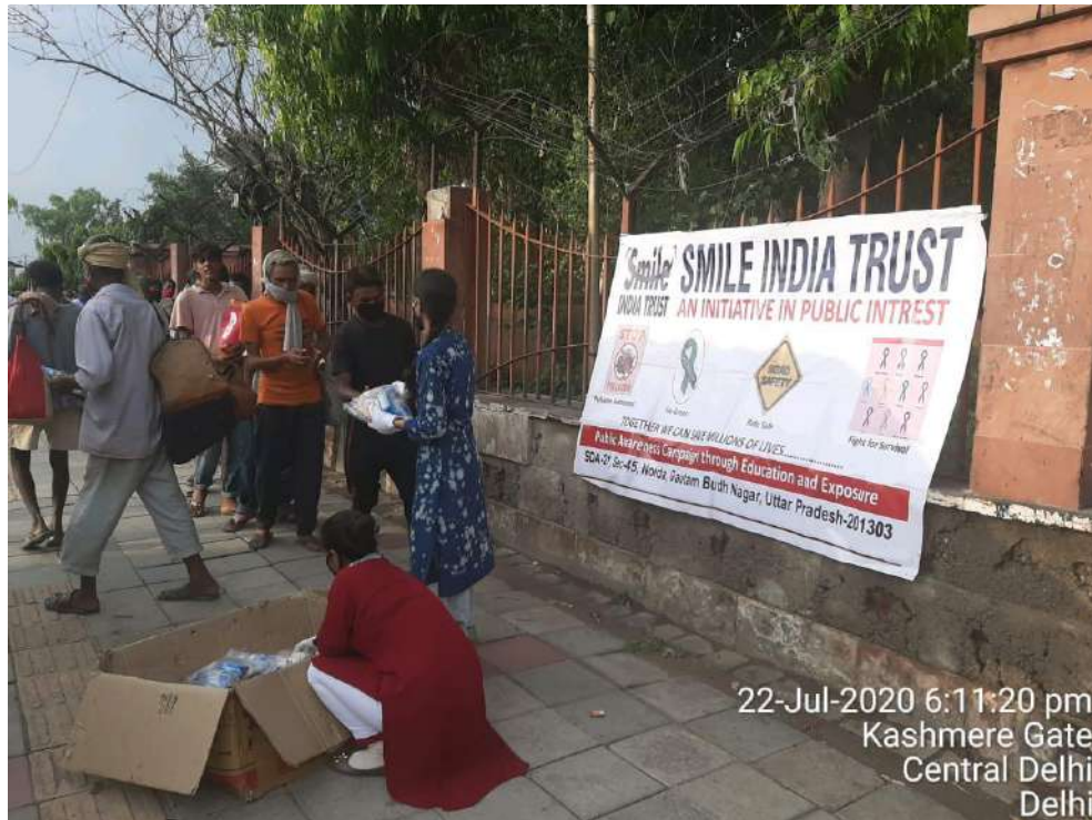
22-Jul-2020 6:11:20 pm Kashmere Gate Central Delhi Delhi