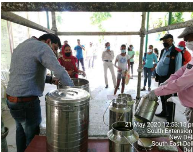
21 May 2020 12:53:15 pm South Extension II New Delhi South East Delhi