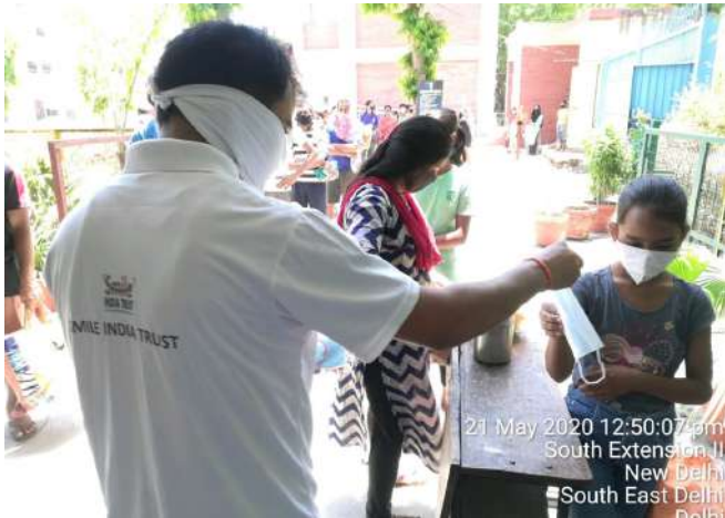
21 May 2020 12:50:07 pm South Extension II New Delhi South East Delhi