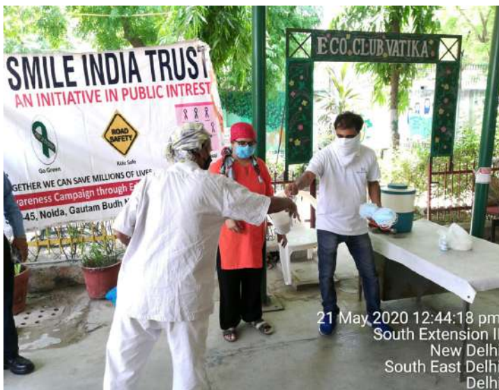
21 May 2020 12:44:18 pm South Extension II New Delhi South East Delhi Delhi