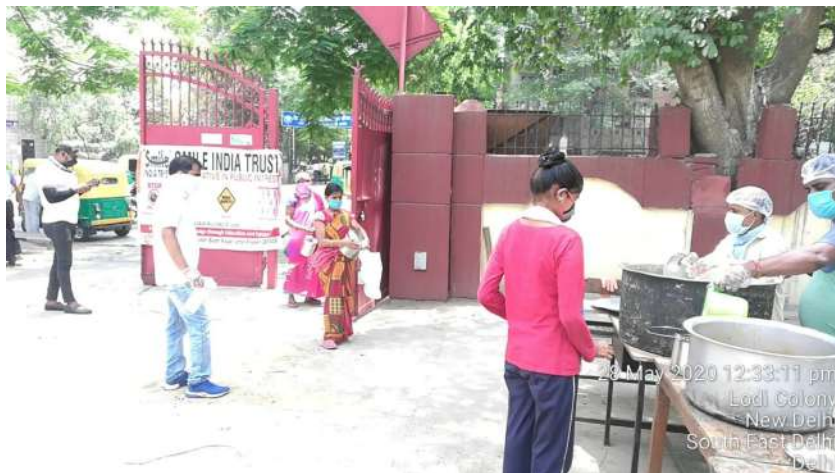
28 May 2020 12:33:11 pm Lodi Colony New Delhi South East Delhi Delhi