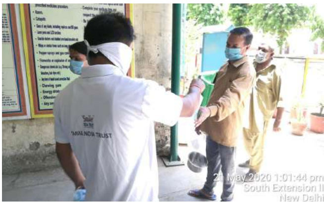
21 May 2020 1:01:44 pm South Extension II New Delhi