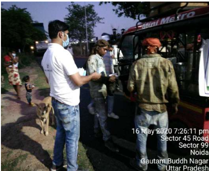
16 May 2020 7:26:11 pm Sector 45 Road Sector 99 Noida Gautam Buddh Nagar Uttar Pradesh