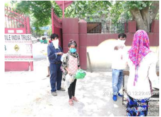
28 May 2020 12:29:49 pm Lodi Colony New Delhi South East Delhi