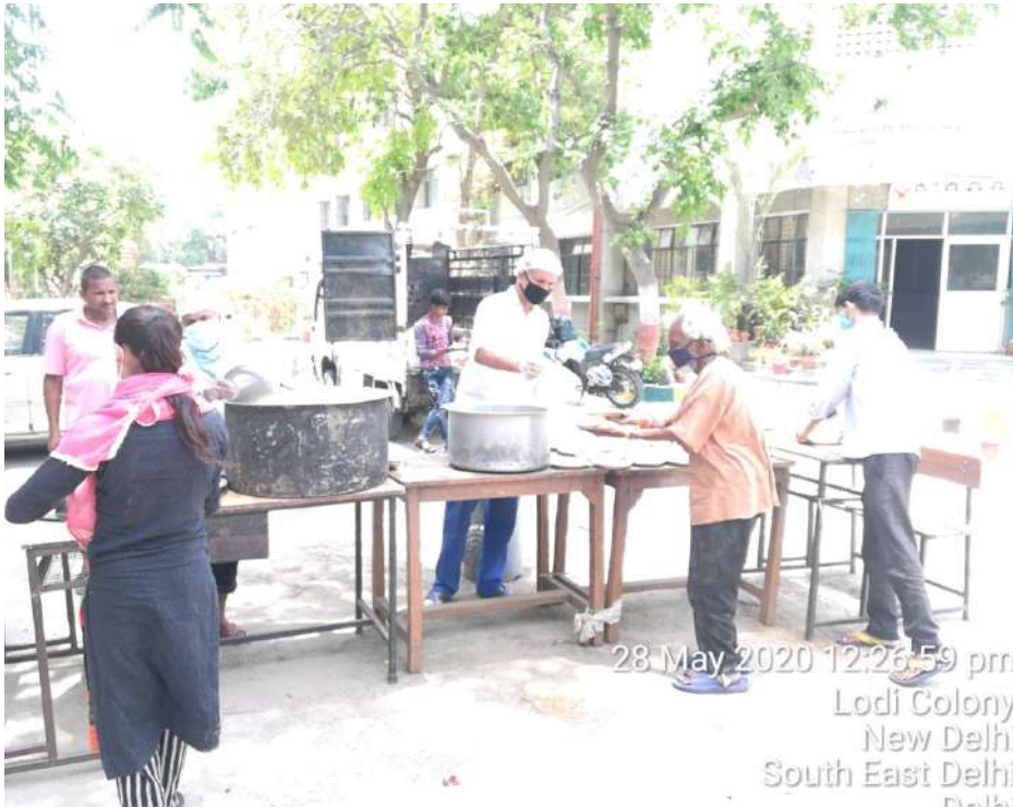
28 May 2020 12:26:59 pm Lodi Colony New Delhi South East Delhi