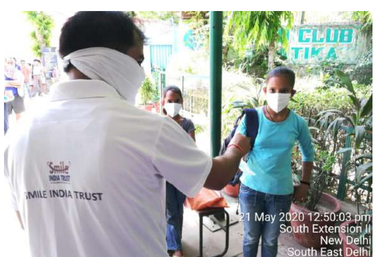
21 May 2020 12:50:03 pm South Extension II New Delhi South East Delhi