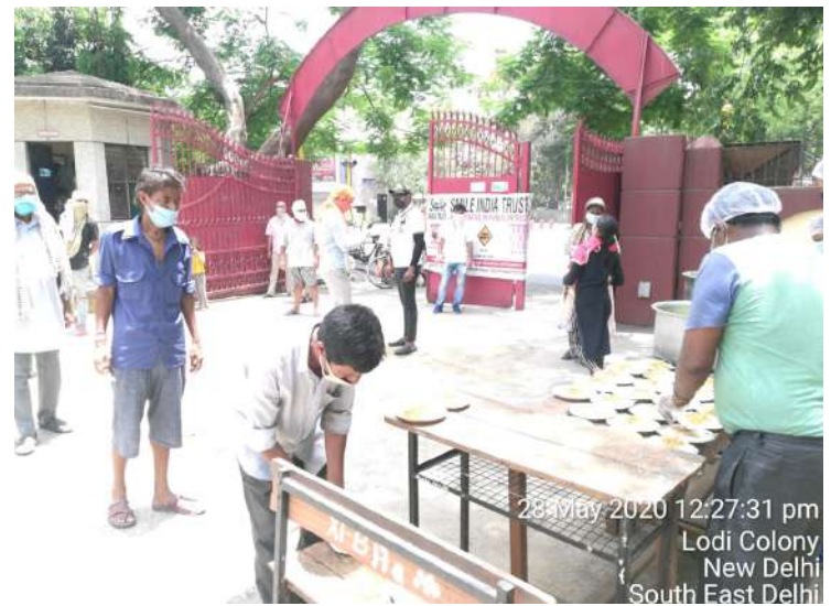
28 May 2020 12:27:31 pm Lodi Colony New Delhi South East Delhi