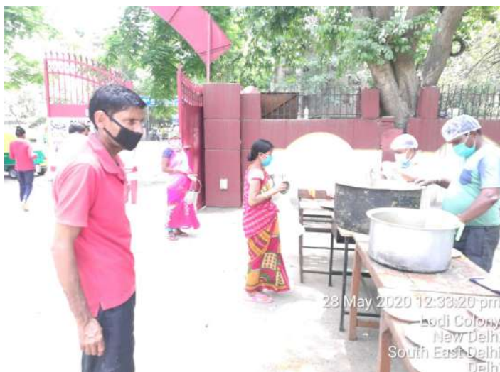
28 May 2020 12:33:20 pm Lodi Colony New Delhi South East Delhi Delhi