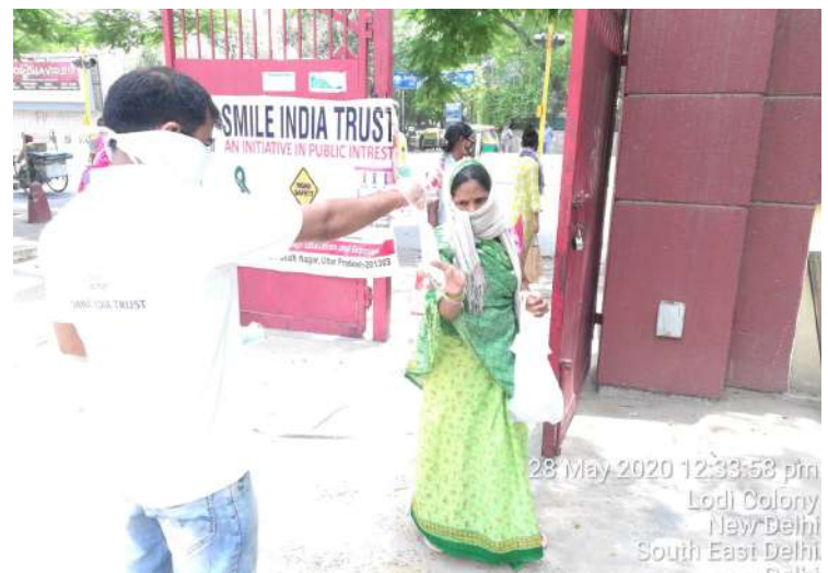
28 May 2020 12:33:58 pm Lodi Colony New Delhi South East Delhi Delhi