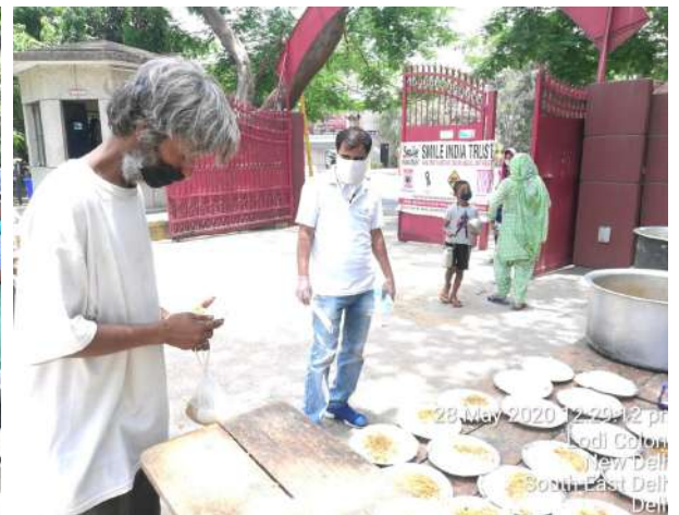
28 May 2020 12:30:12 pm Lodi Colony New Delhi South East Delhi Delhi