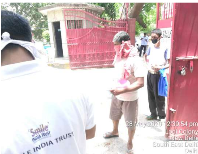
28 May 2020 12:30:54 pm Lodi Colony New Delhi South East Delhi