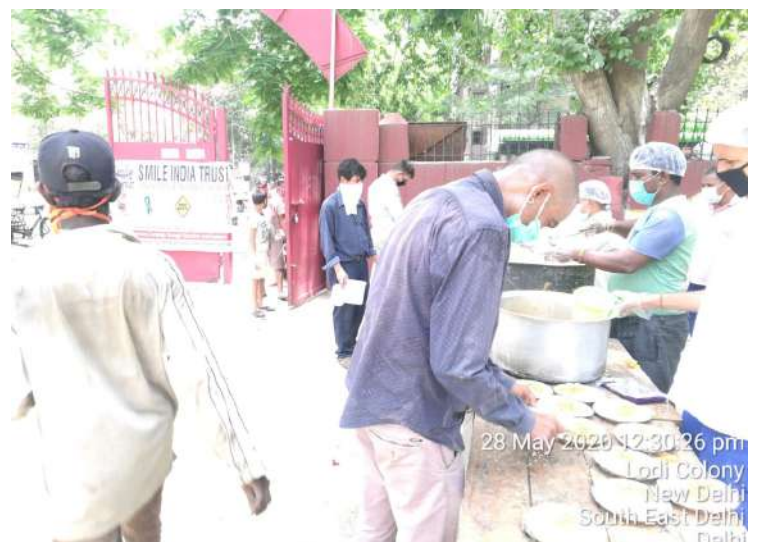
28 May 2020 12:30:26 pm Lodi Colony New Delhi South East Delhi