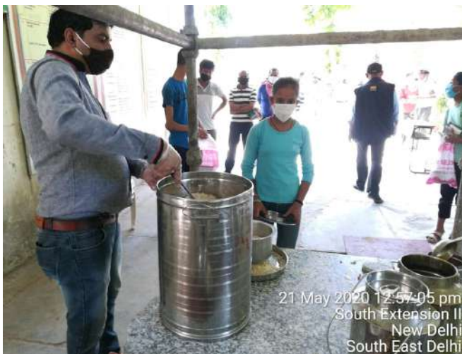
21 May 2020 12:57:05 pm South Extension II New Delhi South East Delhi