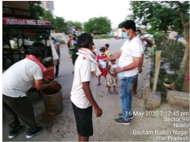
16 May 2020 7:12:45 pm Sector 99 Noida Gautam Buddh Nagar Uttar Pradesh