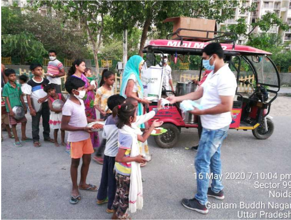
16 May 2020 7:10:04 pm Sector 99 Noida Gautam Buddh Nagar Uttar Pradesh