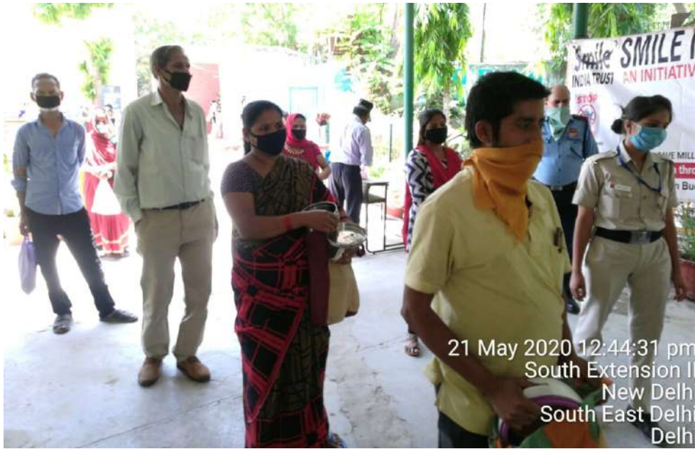
21 May 2020 12:44:31 pm South Extension II New Delhi South East Delhi Delhi