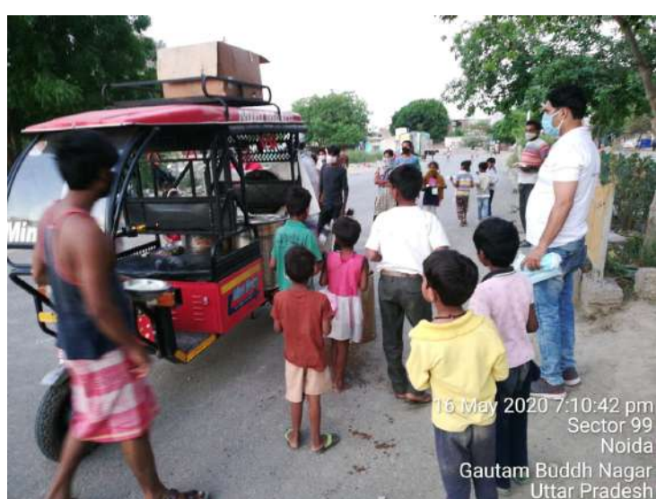
16 May 2020 7:10:42 pm Sector 99 Noida Gautam Buddh Nagar Uttar Pradesh