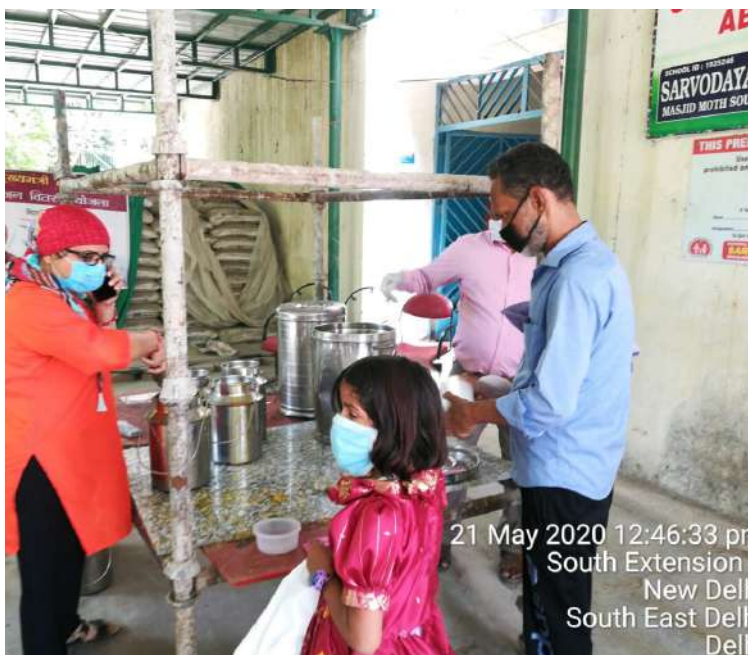
21 May 2020 12:46:33 pm South Extension II New Delhi South East Delhi Delhi