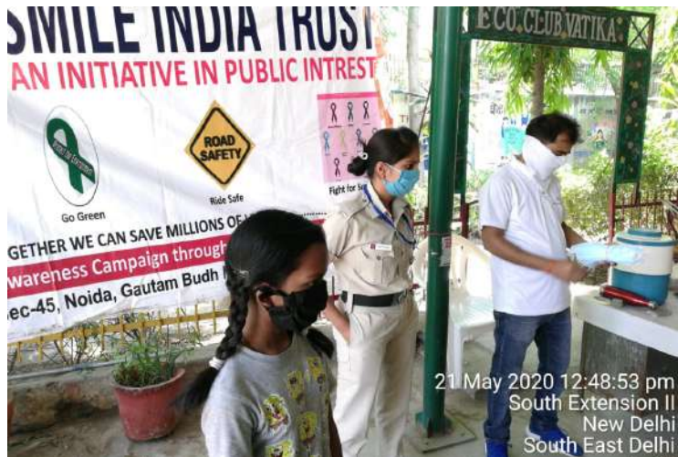
21 May 2020 12:48:53 pm South Extension II New Delhi South East Delhi