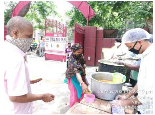
28 May 2020 12:28:19 pm Lodi Colony New Delhi South East Delhi