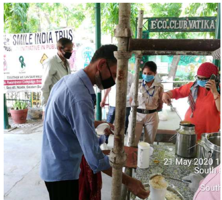
21 May 2020 12:46:33 pm South Extension II New Delhi South East Delhi Delhi