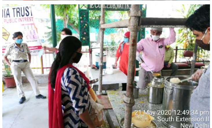
21 May 2020 12:49:34 pm South Extension II New Delhi