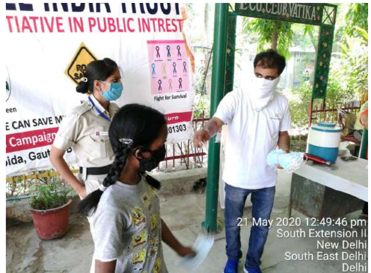
21 May 2020 12:49:46 pm South Extension II New Delhi South East Delhi Delhi