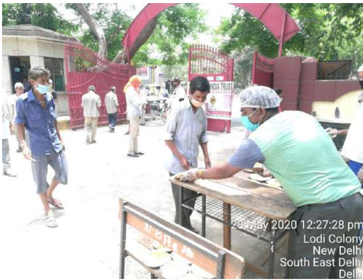
28 May 2020 12:27:28 pm Lodi Colony New Delhi South East Delhi