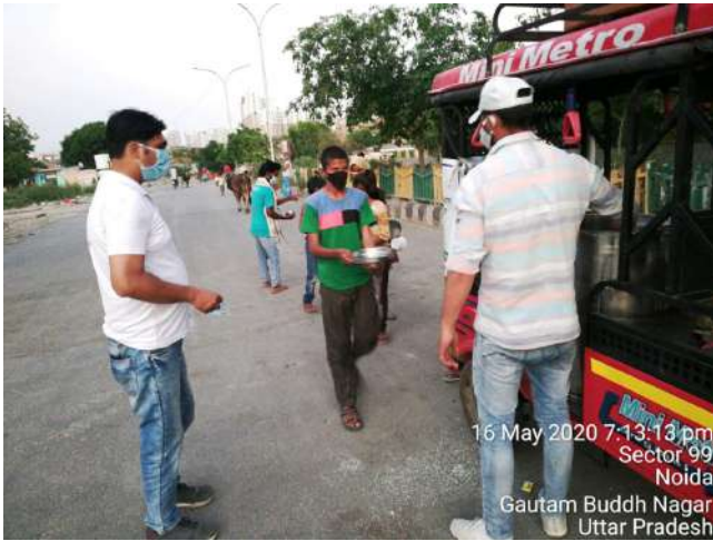
16 May 2020 7:13:13 pm Sector 99 Noida Gautam Buddh Nagar Uttar Pradesh