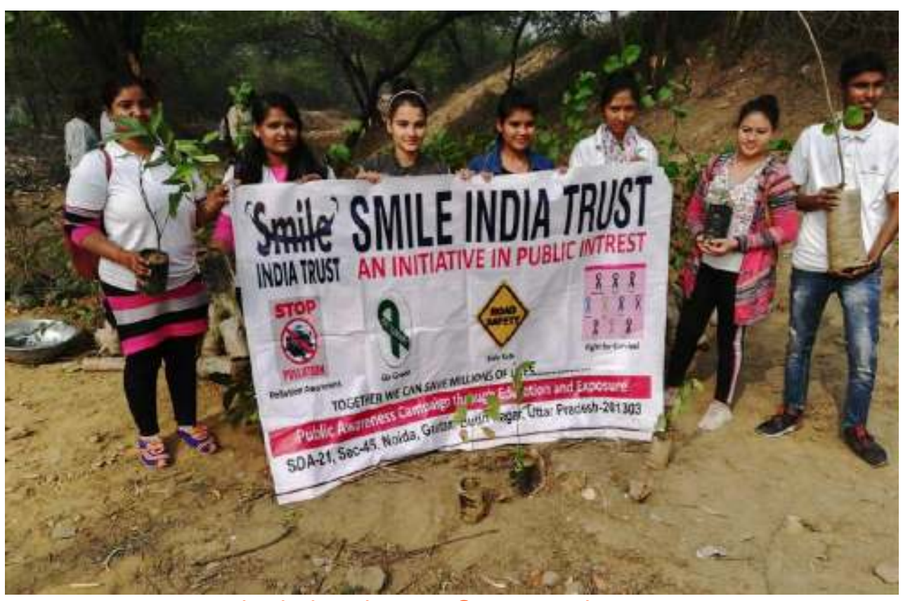
We took an initiative of planting trees to restore greenery.