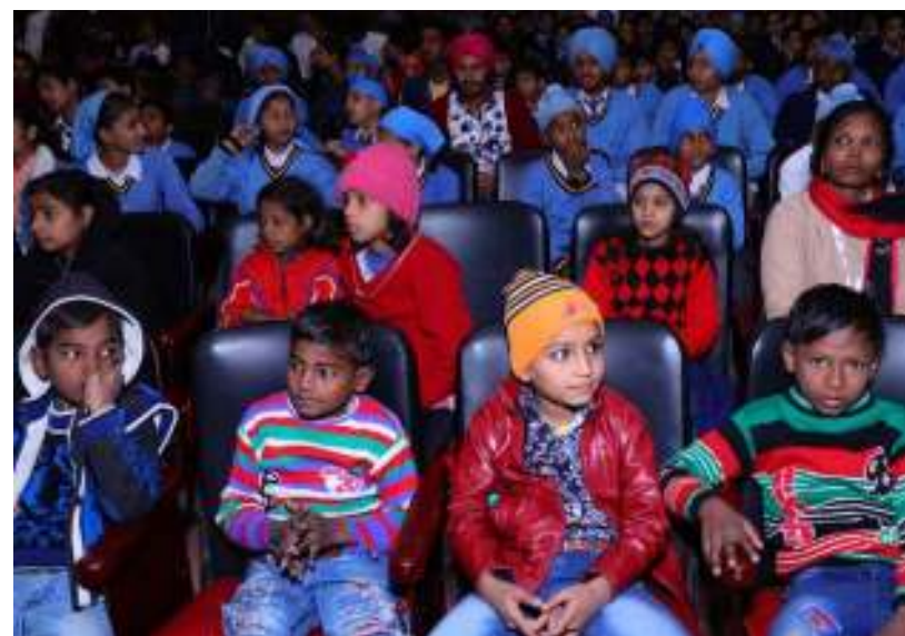
Endeavouring to help them in their overall grooming makes us happy.