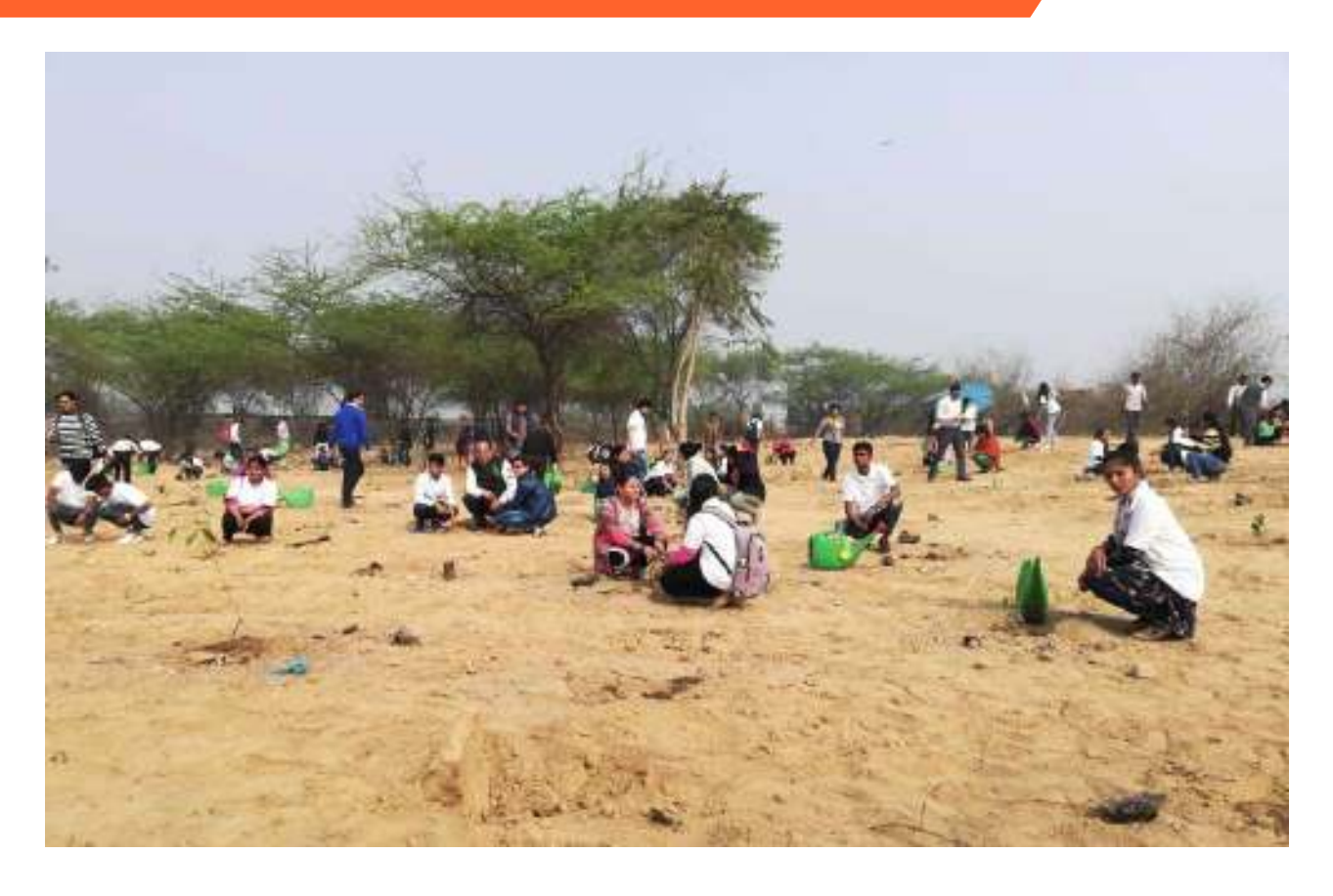
Plant a tree and plant a hope for future.