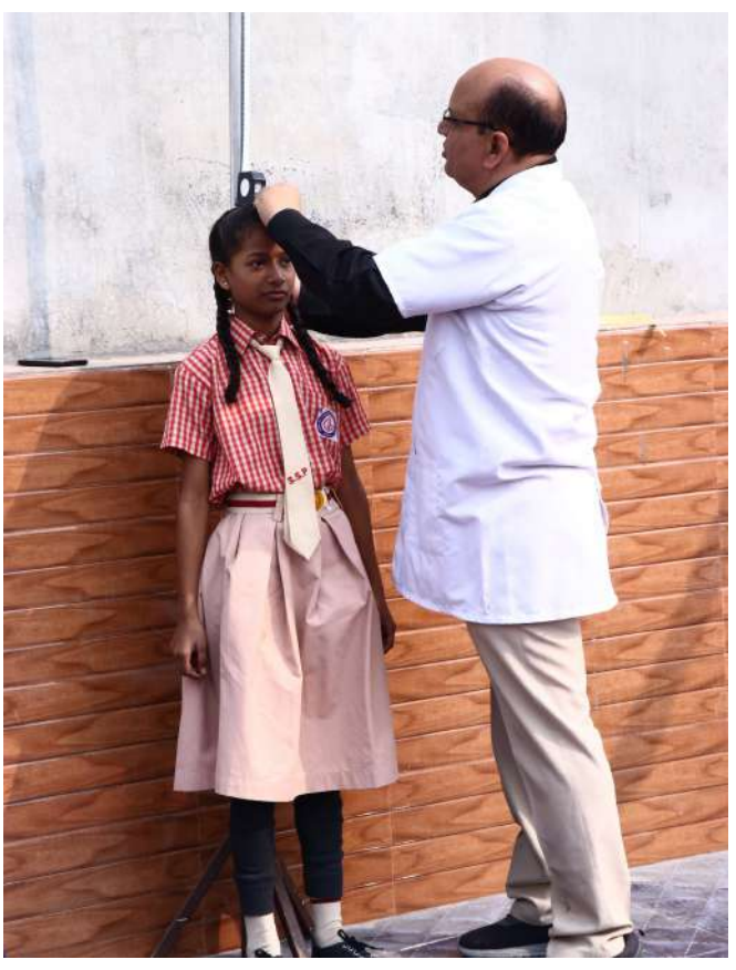
Caring for those who can write the destiny of our nation.