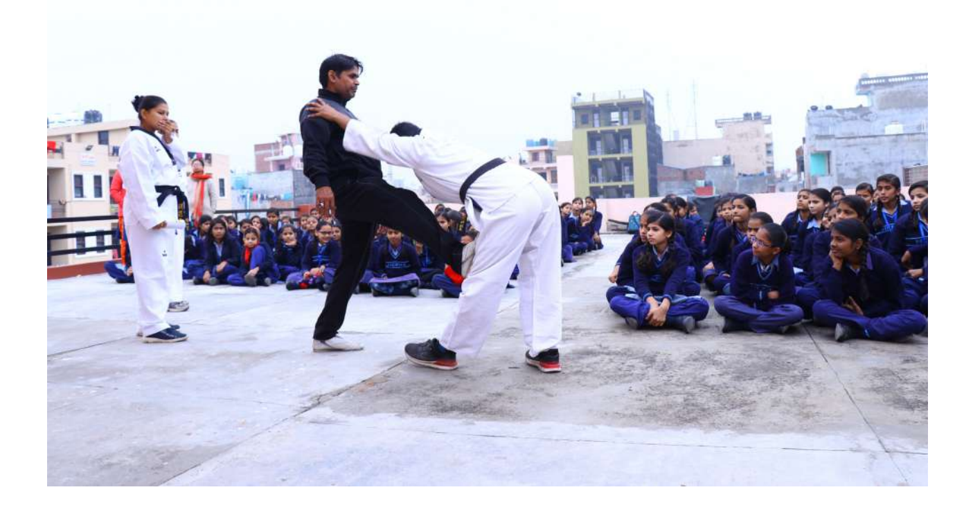
Self defense skills will invoke your intelligence to confront violence and injustice.